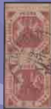
Lot 1528 Est £20