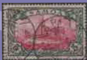
Lot ex 1233 Est £490