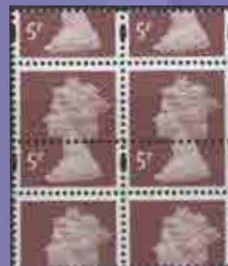
Lot 2712 Est £75