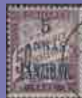
Lot ex 1169 Est £20