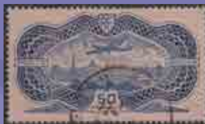
Lot 1099 Est £50