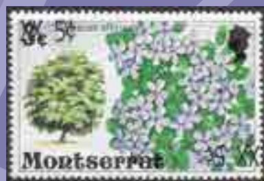
Lot 1727 Est £30