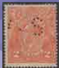
Lot 425 Est £240

Tel: 07938 601513 Email: info@avhstampauctions.co.uk