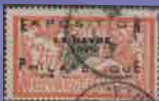
Lot 1077 Est £120