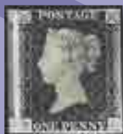
Lot 2382 Est £420