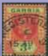
Lot ex 1207 Est £160