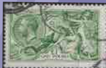
Lot 2604 Est £480