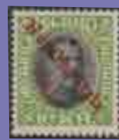
Lot ex 1423 Est £550