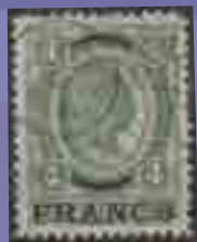
Lot 515 Est £300