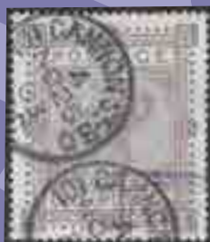
Lot 2476 Est £1,100