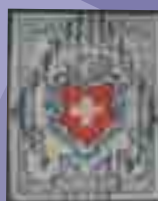
Lot 2141 Est £50