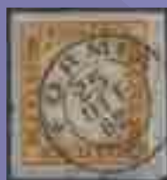
Lot 1515 Est £150