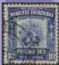
Lot ex 1854 Est £250